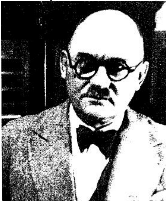
John Rabe. He is the main character in a Chinese–German co-production being filmed about the Nanking Massacre.

Before going into details of this trick, we must trace the changes in the so-called Nanking Massacre. Generally speaking, this fabrication has passed through three phases up till now. The first phase was from the time it all began, with 20,000 dead, to the International Military Tribunal for the Far East (the Tokyo Tribunal) held in Tokyo.